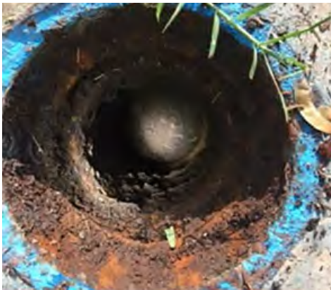
A completely buried valve nut, making it impossible to open/ close the valve.

How many times have you wanted to open a valve box and witnessed one of the following things: