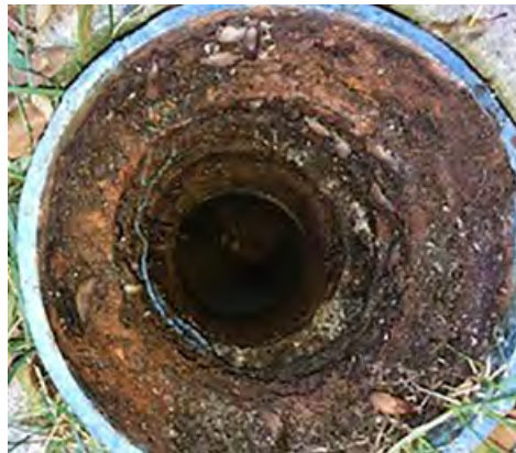
An off-center valve nut, making it impossible to get the valve key onto the valve nut.

Valve Box Stabilizer makes these issues obsolete. This is a cost effective, must-have addition for every utility that installs valve boxes.